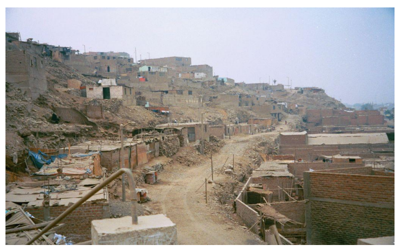
A view of Cerra Candela Lima Peru