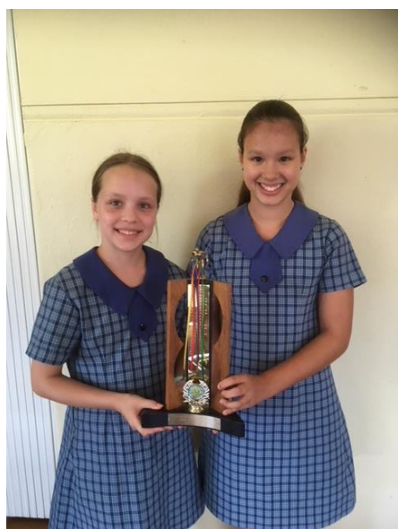
Points Score Trophy POLDING