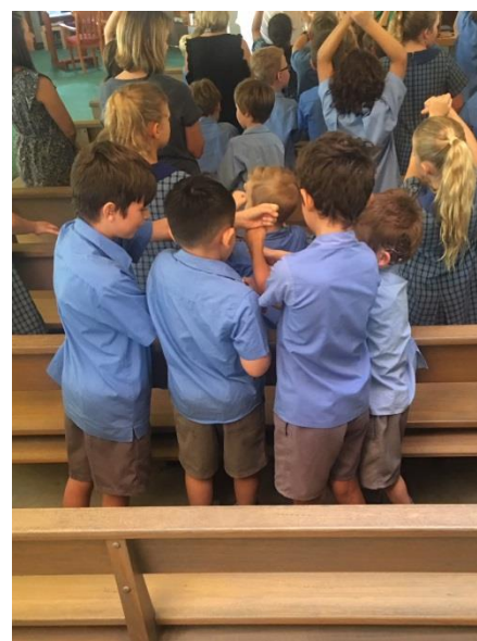
Opening School Mass Year 5 boys with their St Lucy's buddies singing "Build In Love" ~ "we build, we build, we build"