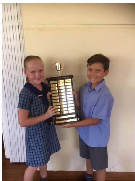
Colour House Spirit Cup ST JOSEPHS