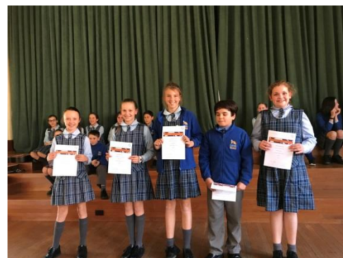
Maths Challenge champions! All five students from Year 6 earned a Distinction (highest award given in this competition) for their amazing work as part of this year's Maths Challenge. All these students actually scored 100% in the Challenge!