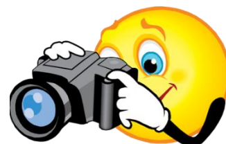
Photo envelopes will be sent home with each child in week 2 of Term 4 (after the school holidays). Photos can be ordered online once you receive your envelope.