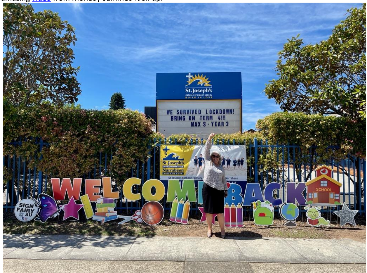
Community ~ Respect ~ Compassion ~ Stewardship

We are so excited to be able to welcome back the rest of the students, from years 3-6 from Monday 25 October. Our amazing <u>video</u> from Monday summed it all up.