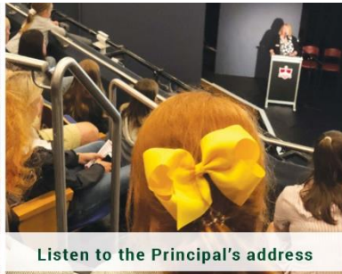
Listen to the Principal's address