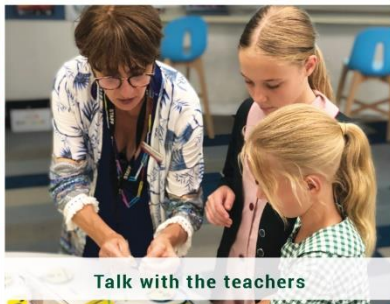
Talk with the teachers