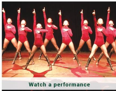
Watch a performance