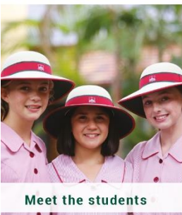
Meet the students