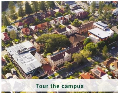
Tour the campus