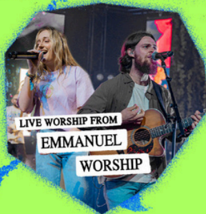
LIVE WORSHIP FROM EMMANUEL WORSHIP

STREAMS FOR KIDS, HIGH SCHOOLERS, YOUNG ADULTS AND DEEPER FORMATION FOR 25+